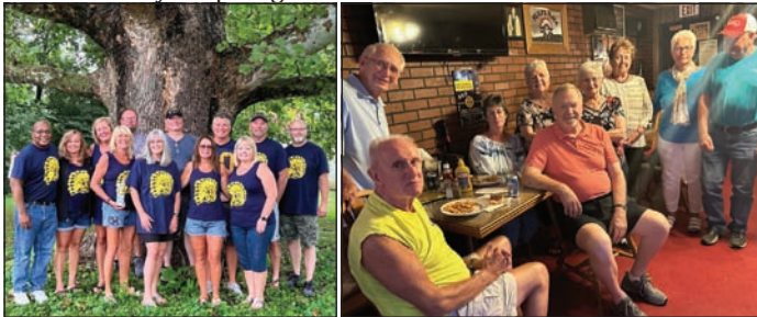
1983 Gang under TGS sycamore Some of '60 & '61 group at Kelly's Place

This year, more than ever it seemed, classmates of the past focused on PWD weekend to stage get-togethers around the town to revel in days of past glories and misadventures.