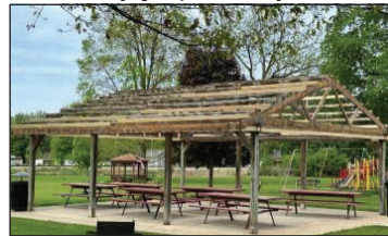
East Park Picnic Shelter in Progress

Hats off to Tiskilwa Community Association for once again organizing a Pow Wow Days weekend that we could all rally 'round: for their months of planning, their work on sprucing up the village before the event, and their dedication during the weekend to assure all went smoothly despite the rainy surprise. Did you know that, among countless other volunteer efforts, they cleaned Main Street to re-stripe it and rebuilt the East Park picnic shelter after a roof collapse? Many of their good works go unrecognized but not unnoticed. TCA is a huge blessing to our entire community. Someday, we'd like to print a list of all the community projects they've accomplished over the years.