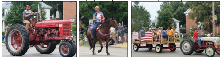
Clockwise from upper left: