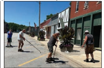
TCA Clean-up on Main Street