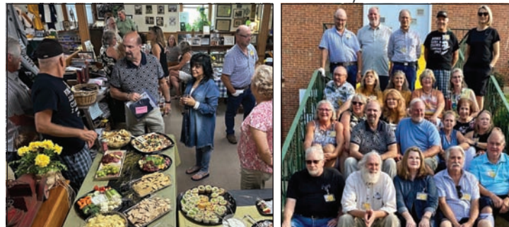
Left: Great snacks and good times in the galleries of Museum on Main